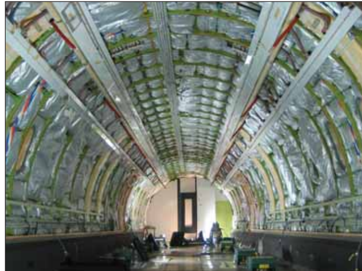
Noise reduction application (by A.I.M.S. Int'l) on a Challenger 870 pending final delivery to customer.

Most aviation professionals in the aircraft completions business, at one point in time during their careers, have had to grapple with the issue of "noise reduction." Much has transpired in terms of the technology and materials driving this issue within the last decade. I will briefly touch upon some of these developments in the hope that it provides a better understanding of the noise reduction technology used in business aviation today.