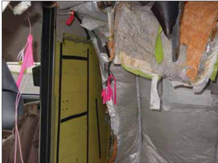
Example of poor noise reduction application on an early model Challenger (behind flight deck).